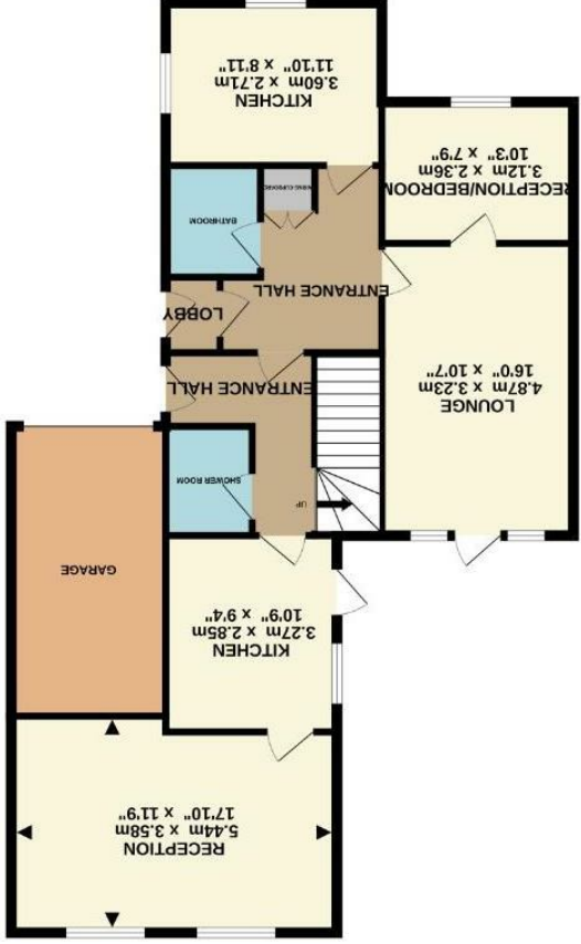
GROUND FLOOR (1029 sq.ft.) approx.

TOTAL FLOOR AREA: 128.4 sq.m. (1382 sq.ft.) approx.